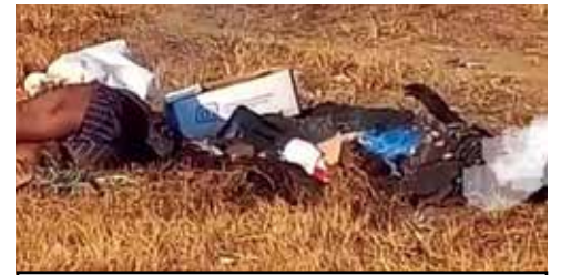
The lifeless bodies of the two men who were assaulted and set alight by angry community of Moteti after accusing them of committing house breakings.

"The police will continue to work around the clock and ensure that criminals in Dennilton policing precinct are removed and put behind bars. The rule of law and order shall prevail without fear or favour. Further operations are planned to maintain the momentum and keep the community safe," concluded Hadebe.