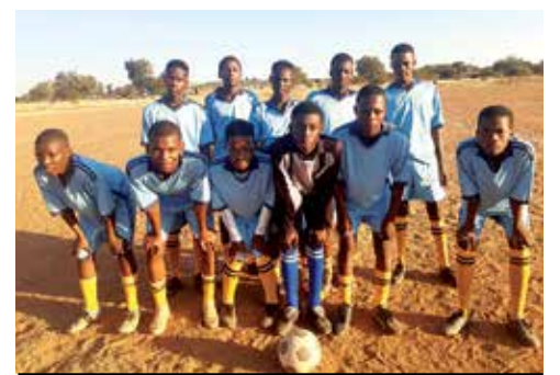
Elandskraal Vultures FC is one of the teams promoted to Hollywoodbets Sekhukhune Regional Football League after excelling in the EPMLM LFA Playoffs.

The Ephraim Mogale Local Municipality (EPMLM) promotional playoffs matches were played on Sunday 22 September 2024 at Mmakgale Village outside Marble Hall. Four football teams, MG Sporting FC, Flog Tigers FC, Bakone Hero Boys FC and Elandskraal Vultures FC, battled it out in a point system tournament fighting for promotion to the Hollywoodbets SAFA Sekhukhune Regional Football League. During the playoffs, Bakone Hero Boys faced Flog Tigers in the first match of the day where Tigers emerged victorious with 2-0 score-line in a tightly contested encounter. The second game saw Elandskraal Vultures taking on MG Sporting. The teams shared spoils with 1-1 draw. In the third match of the day, Hero Boys trembled MG Sporting 6-1 to maintain their top spot in a promotional mini tournament. The final match of the day was played between Flog Tigers and Vultures whereby Vultures managed to win the match with 1-0 score. After two matches each, Bakone Hero Boys and Elandskraal Vultures got promoted to Hollywoodbets Regional League in the district. The playoffs log standing was as follows, Hero Boys was leading with 6 points, followed by Vultures in the second spot with 4 points, MG Sporting was third with one point and Flog Tigers was in the bottom of the log with zero points. Speaking to the publication, EPMLM LFA Chairman, Frans Mashabela,