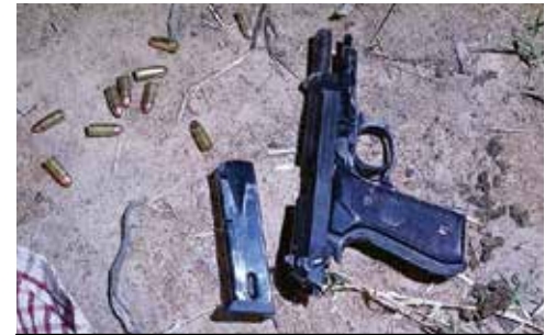
The firearm that was recovered by the police during a stop and search High Density Operation Shanela conducted in Dennilton.